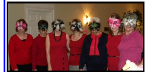
Your new flock of officers